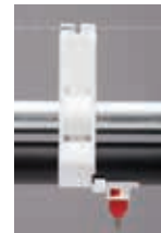
Big Ace Clip-on