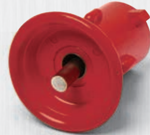
Big Z Shielded Drinker for Females

DO NOT attempt to use standard-sized drinkers in Broiler Breeder Applications.